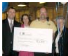
UAW-GM representatives show their support of the Make a Million campaign.

The Foundation would also like to thank its presenting sponsor, Spirit Mountain Casino, and statewide partners United Auto Workers-General Motors, U.S. Bank, Regence BlueCrossBlueShield of Oregon and The Oregonian. The program was also supported around the state with media partners K103 and KATU in Portland, BendBroadband and 98.3FM The Twins in Central Oregon, KOOL 99.1FM and KMTR in Greater Lane County, as well as KTVL and all